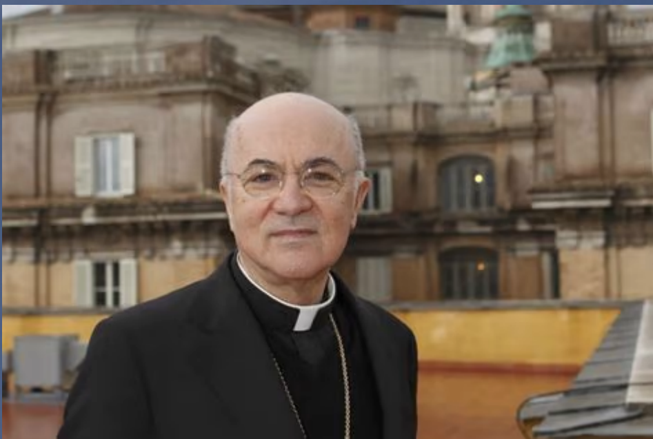
MSGR . CARLO MARIA VIGANÒ , ARCHBISHOP

I earnestly hope that my appeal for the establishment of an Anti-Globalist Alliance that unites the peoples of the world in opposition against the tyranny of the New World Order will be accepted by those who have at heart the common good, peace between nations, concord among all peoples, freedom for all citizens and the future of the new generations.